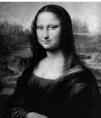
'Mona Lisa', one of the codes in the story.