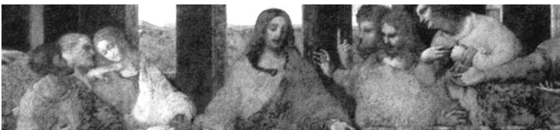
'The Last Supper', another of the the famed creations of Leonardo da Vinci.

"Dan Brown has created the impression that his fiction is a historical fact," he said. In the letter the Archbishop has requested the Indian film board to ban the movie in India and appeals to all the Christians to boycott the movie on the grounds that the "film is going to affect the religious beliefs and sentiments of Christ's believers."