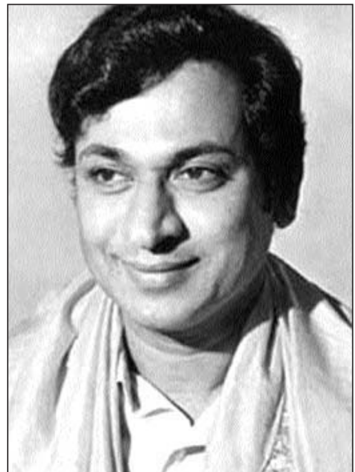
Young Rajkumar, the adored matinee idol.