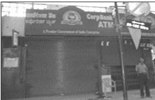
A Corporation Bank ATM with shutters down