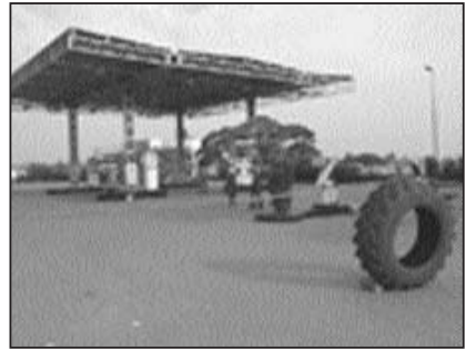
The deserted and closed down IOCL petrol bunk in Kengeri Satellite Town.

However, perhaps as a result of prayers by his countless well-wishers, Dr. Rajkumar was released unharmed on November 15, 2000, after 109 days of captivity. The miraculous escape of Dr. Rajkumar was nothing less than a mystery. An already famous actor had become world renowned after his abrupt kidnap and enigmatic release. He had received brilliant opportunities to join state politics but he always shied away from active politics keeping films as the first and last love of his life. The variation of talent he portrayed seems to make it impossible for anyone to equal him in the near future.