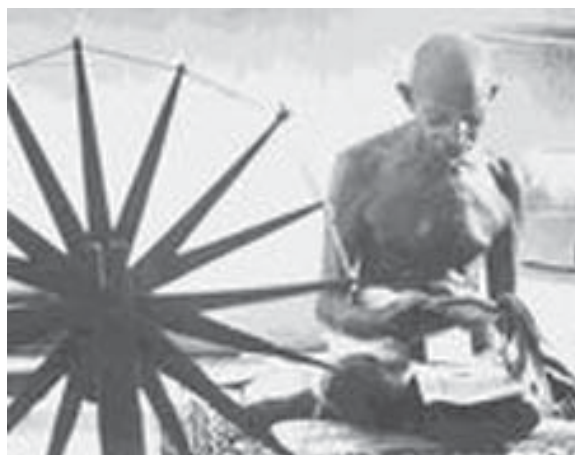
From top: shop keepers at Khadi Vastralaya, Bangalore; Mahatma Gandhi at a spinning wheel. Shopkeepers say that most khadi wearers are involved in the Gandhian movement.