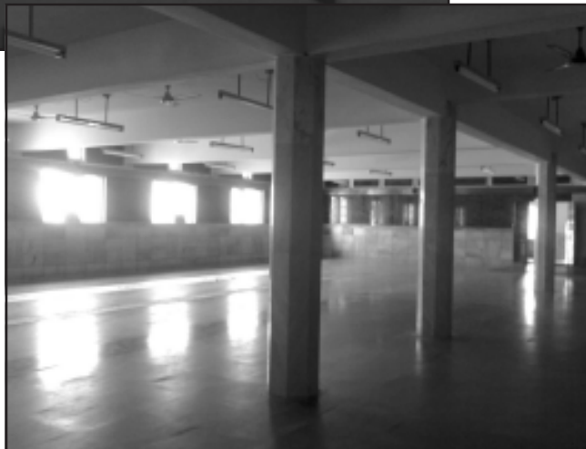
The Temple town of Yedyur - a bull 's statue that surmounts the temple and the dining hall for the devotees inside the temple.

highway. You can easily find autos that will take you there. Some will even wait until you finish your meal and bring you back, for an extra charge of course. While there, try out the soft, fluffy rotis that are instantly prepared in a hot tandoor , which go well with a side order gravy dish of paneer butter masala or chana masala. Also on the menu is a host of other vegetable and non vegetarian complements for you to choose from. For other dietary options, you would have to travel another few kilometers to the highway rest stop or continue to Kunigal, 18