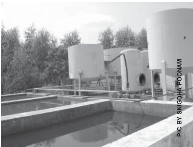
Pictures (clockwise): Electricity generation plant; Water recycling system and a worker cutting wood for feeding into the plant.

agency, Karnataka Council for Science & Technology Limited, (KPTCL) and Bharatiya Agro Industries Foundation (BAIF), an NGO, are working to balance the energy, irrigation and biomass needs of the region.