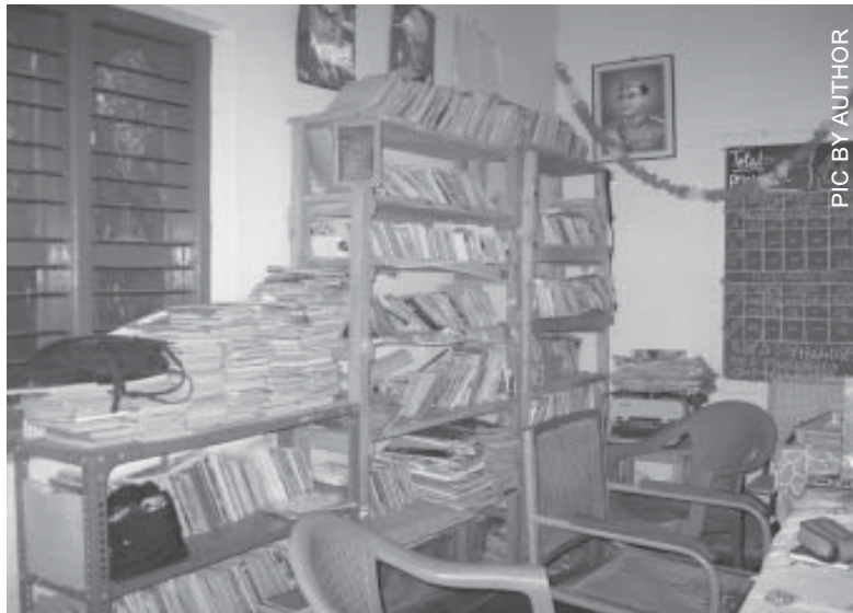
The public library of Kunigal has a total of 2,700 books, out of which 2,500 are his own collection.